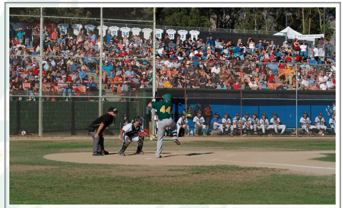
Play in front of large fan bases up and down California