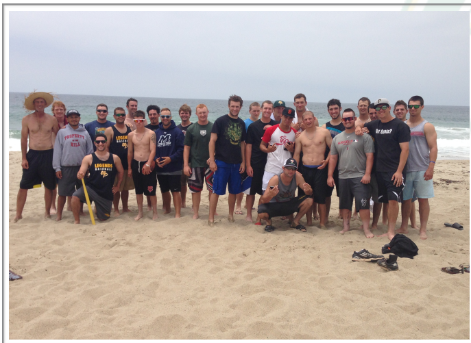
Experience beautiful California