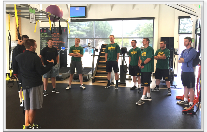
State of the art training facilities, first class host family accommodations and more all situated in beautiful Northern California!