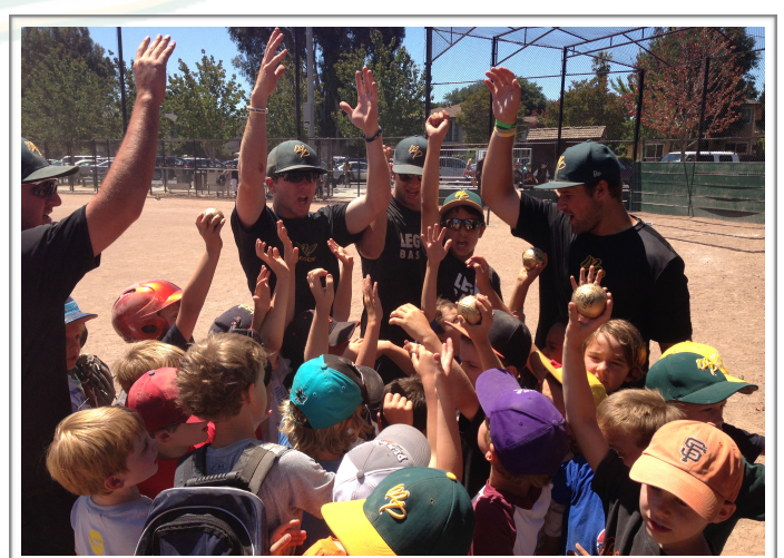
Opportunity to work at Legends youth camps