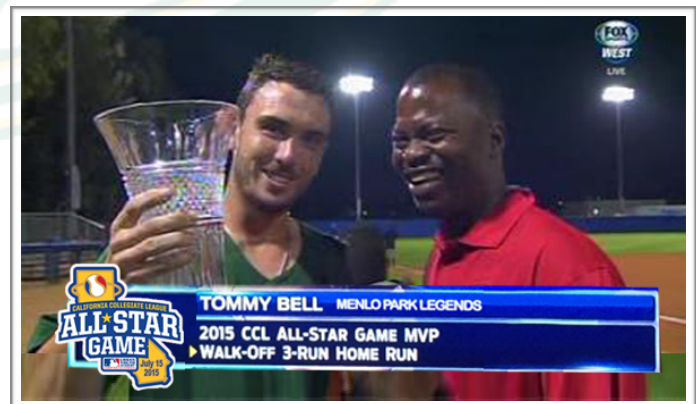
All Star Game nationally televised