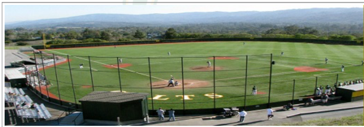
Legends home field